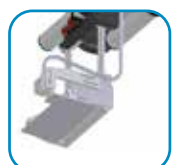
MINI EASY JET