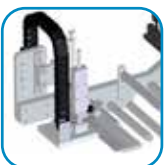
HIGH PRECISION SAFE